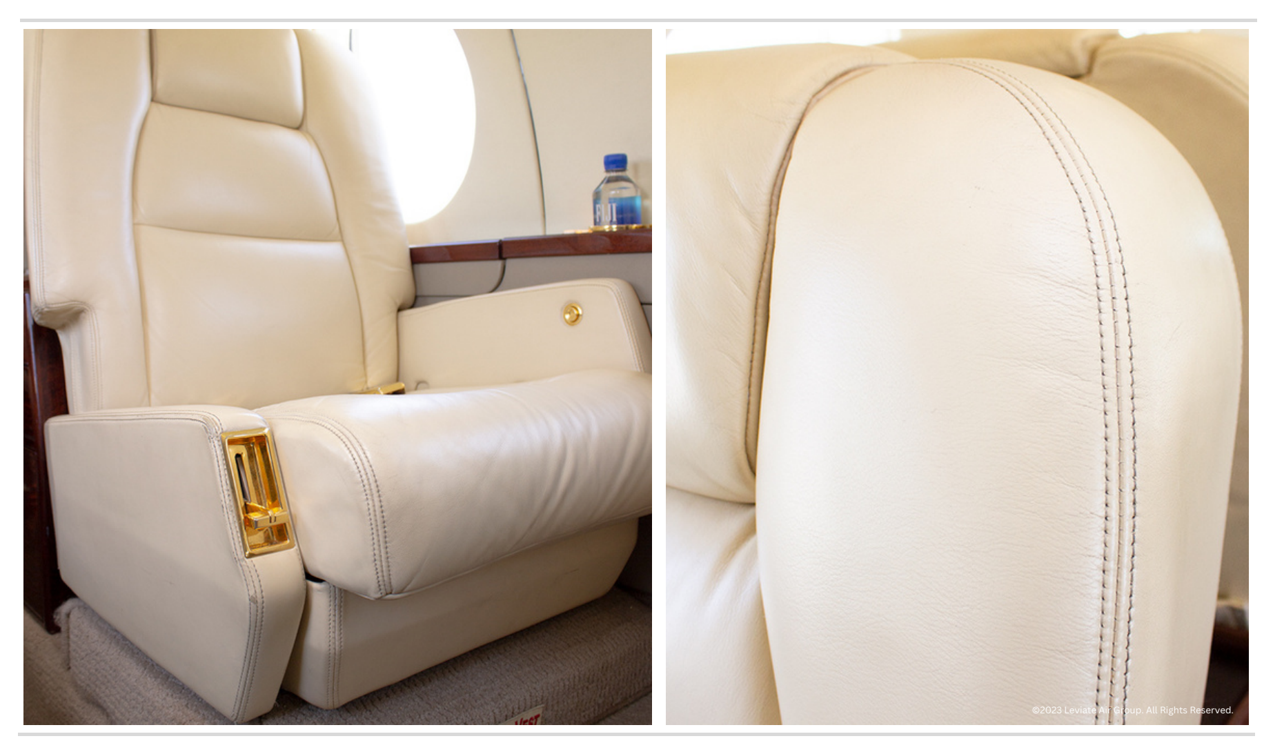
*Specifications are subject to verification upon inspection and should not provide a basis for reliance or create any other binding obligation.