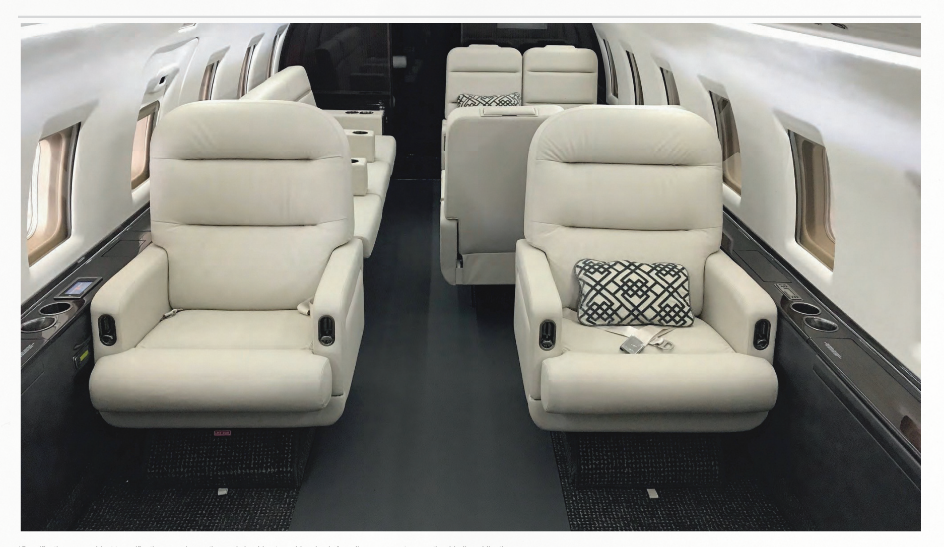
*Specifications are subject to verification upon inspection and should not provide a basis for reliance or create any other binding obligation.