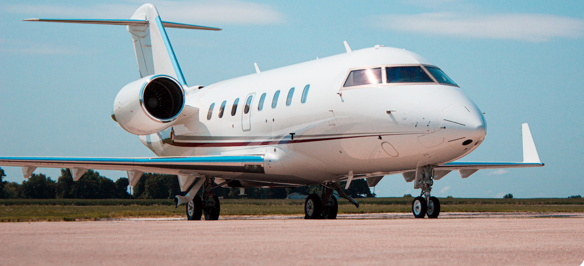
2017 BOMBARDIER CHALLENGER 650