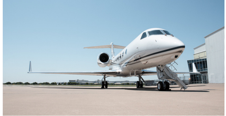
Pictured above is a Gulfstream G450 operated by Leviate Jet Management. The G450 is a popular large cabin/long range aircraft in the charter market.