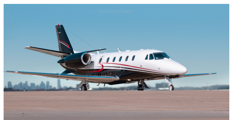
Pictured above is a Citation XLS+ operated by Leviate Jet Management. Leviate has extensive experience on the Citation 560XL (Excel/XLS/XLS+) type.

Leviate Jet Management currently manages a fleet of aircraft ranging from midsize jets such as the Cessna Citation XLS to large cabin and long range jets such as the Gulfstream G450. We operate these aircraft on a worldwide basis, having completed many extensive charter trips around the world. Our global operating capabilities and experience are a significant benefit to our owner-clients, particularly with large and super-mid cabin aircraft with intercontinental range and payload. In addition, senior managers in our maintenance department, such as the Director of Maintenance, are factory-trained on numerous aircraft including Gulfstream, Bombardier, Learjet, and Citation models.